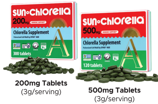
200mg Tablets (3g/serving)

Choose from our classic 200mg easy-to-swallow tablets or 500mg larger sized tablets that give you the same serving of chlorella in fewer tablets.