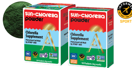
30-Packet Box (6g/packet)

Sun Chlorella® Powder can be easily incorporated into any drink or recipe. Available in a box of 10 or 30 individual daily serving packets.